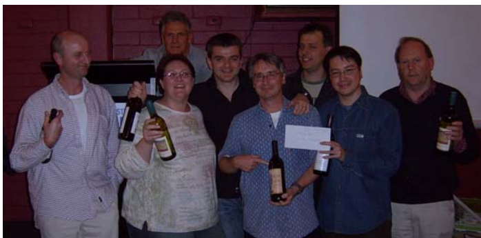
Above: Congratulations to our winners!